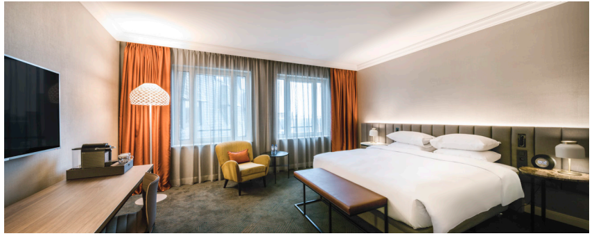
Picture: Executive room

FROM THE TRAIN STATION: from Brussels-South (Thalys, Eurostar & SNCB) 5 minutes by train.